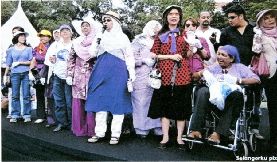
Women's rally: Blackout in BM, English papers